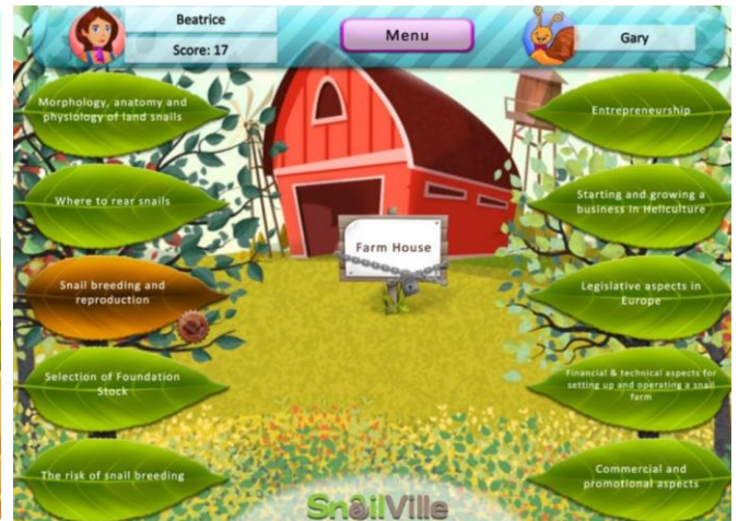
Some pictures of the game