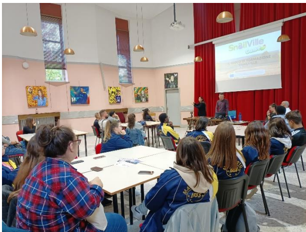
Some pictures of the Italian ME presentation

To register and download the game 🔗 https://snailville.lykio.com/login